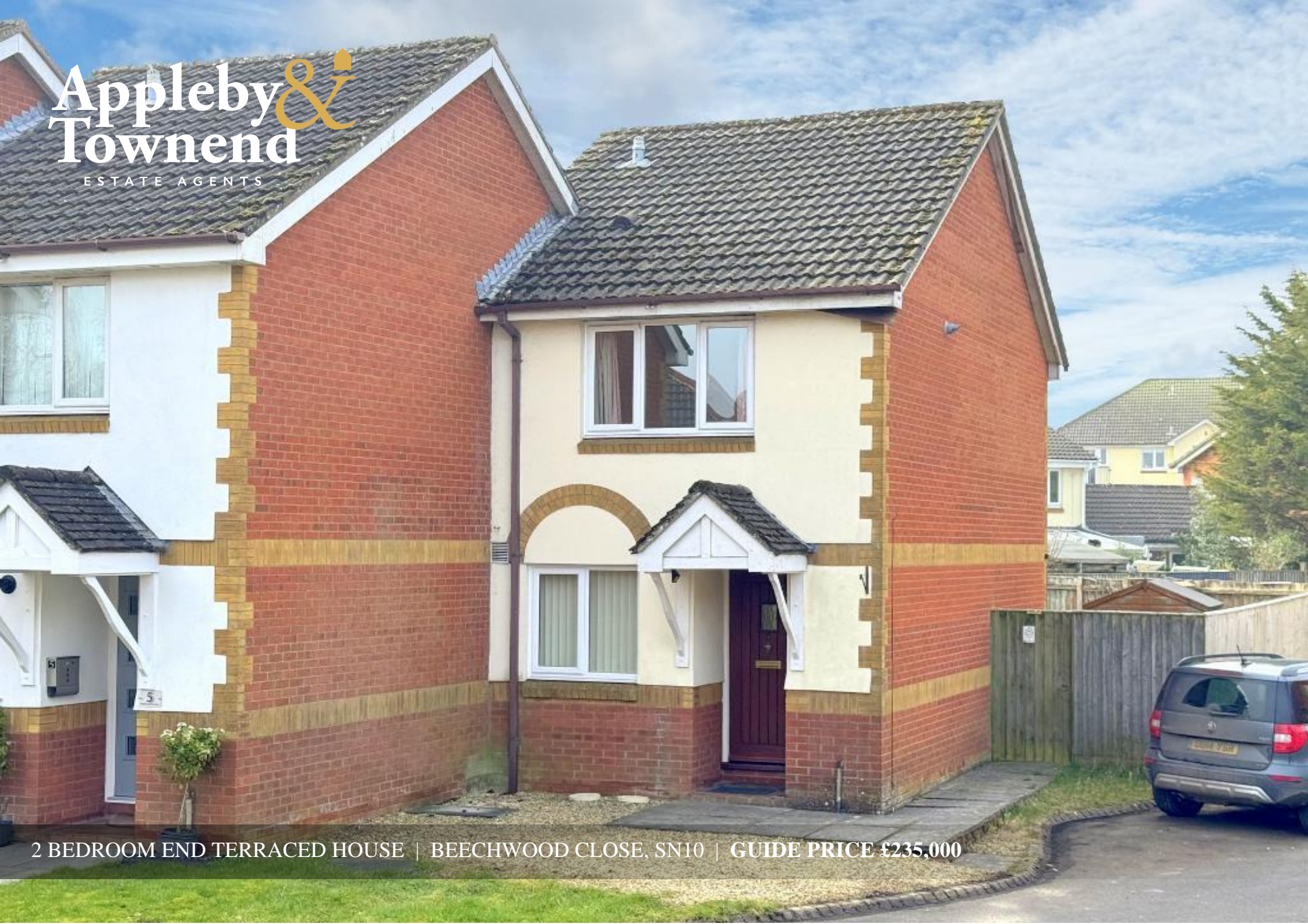
2 BEDROOM END TERRACED HOUSE | BEECHWOOD CLOSE, SN10 | GUIDE PRICE £235,000